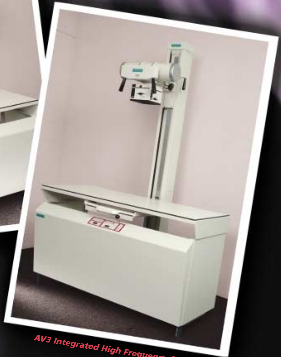
AV3 Integrated High Frequency System