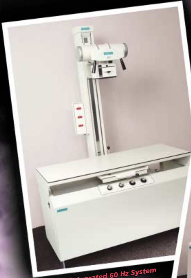
AV2 Integrated 60 Hz System